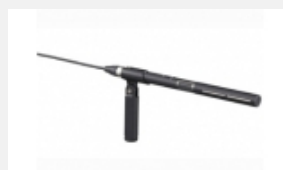
ECM-680S MS stereo shotgun Electret condenser microphone