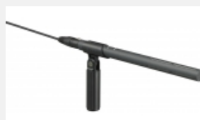
ECM-674 Affordable shotgun Electret condenser microphone