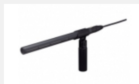
ECM-678 Shotgun Electret condenser microphone