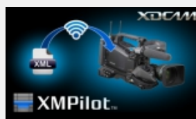
XMPilot XDCAM Metadata Workflow Solution