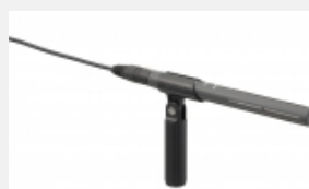
ECM-673 Short Shotgun Electret Condenser Microphone.