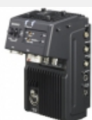
XDCA-53 HD Camera Adaptor for PMW-EX3