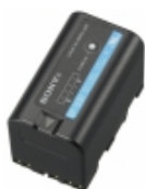
BP-U30 Lithium-ion Battery